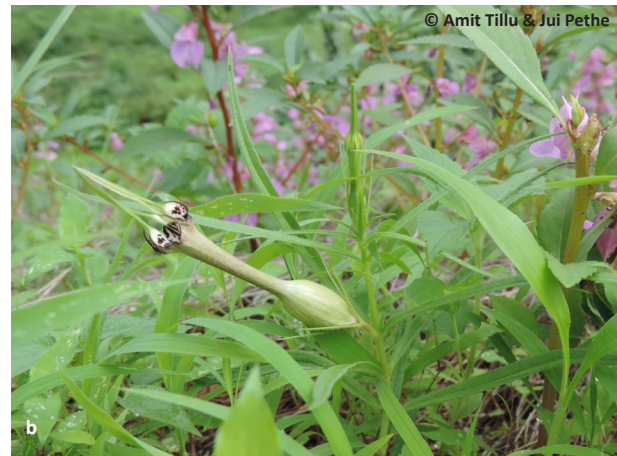
Image 2. Ceropegia mahabalei blooming in its habitat.

Borgad Conservation Reserve. The small population of not more than 25 individuals is threatened by grazing, trampling, tourism and extraction.