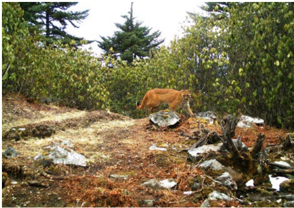
Image 1. Asiatic Golden Cat in Phrumsengla National Park, Central Bhutan