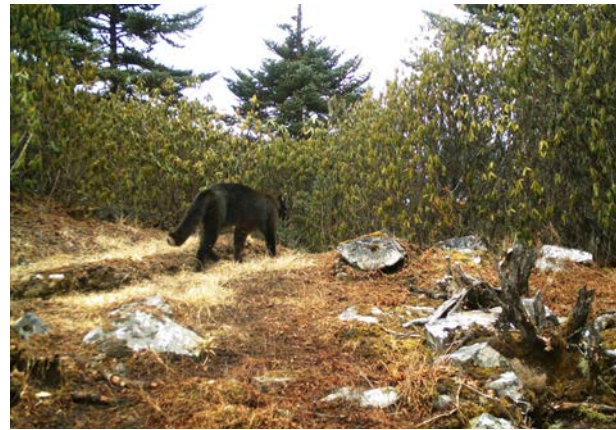
Image 2. Melanistic Asiatic Golden Cat in the same location in Phrumsengla National Park