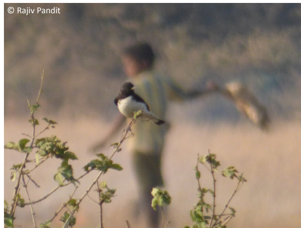
Image 1. Variable Wheatear Oenanthe picata close to TISS Tuljapur Campus, Osmanabad District, Maharashtra, India.