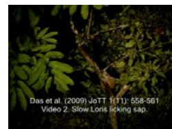
Video 2. Slow Loris licking sap.