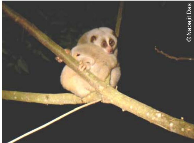
Image 2. An adult Bengal Slow Loris in GWLS in a typical resting posture.

survey including transect length, animal transect distance, number of individuals, distance of the animal from the observer, angle of the animal from the transect line, latitude and longitude, time of detection, activity when first detected, tree height in which it was sighted, tree where it was detected and vegetation type were recorded (Nekaris & Jayewardene 2004). Photographs of the sighted animal were taken when possible.