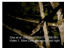
Video 1. Loris escap-ing from floodlight.

The presence of Bengal Slow Loris in GWLS indicated the possibility of conducting long-term population and behavioural studies. Generally all loris species are sparsely distributed throughout much of their range (Nekaris et al. 2008). Bengal Slow Lorises may occur only in a few isolated populations in some parts of Assam. Despite a serious danger of becoming extinct in many parts of Assam (Radhakrishna et al. 2006), conservation action for this species is still neglected in the western part of its distribution range.