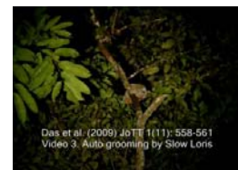
Video 3. Auto groom-ing by Slow Loris.